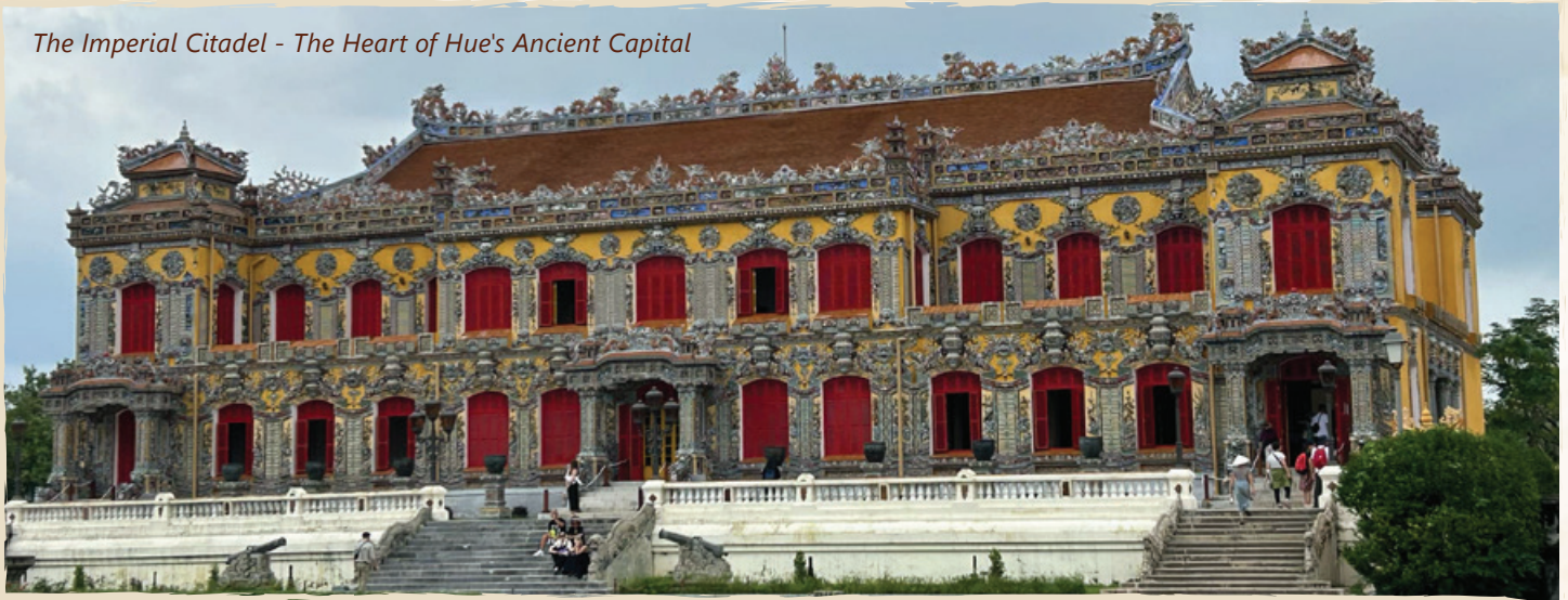
The Imperial Citadel - The Heart of Hue's Ancient Capital